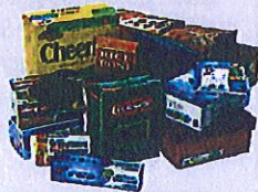
Boxboard, cereal boxes, dry food boxes