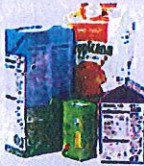
Empty wax-coated paper containers and juice boxes