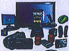
Batteries or Electronics