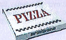
Take out pizza boxes free of food residue