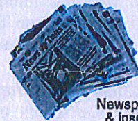
Newspaper & inserts