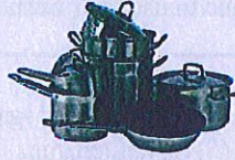
Pots & pans