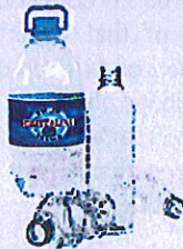
Empty plastic bottles