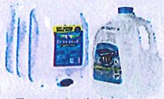
Empty plastic jugs