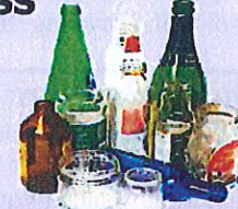
Clean glass jars & bottles