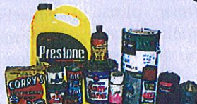
Hazardous or toxic product containers