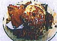
Food & wet waste, food contaminated paper & napkins