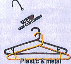
Plastic & metal hangers