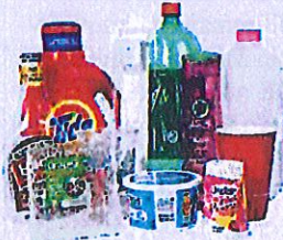
Clean plastic containers Plastics #1, #2, #4, #5, & #7 See bottom of container for #1