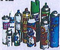
Empty Aerosol cans